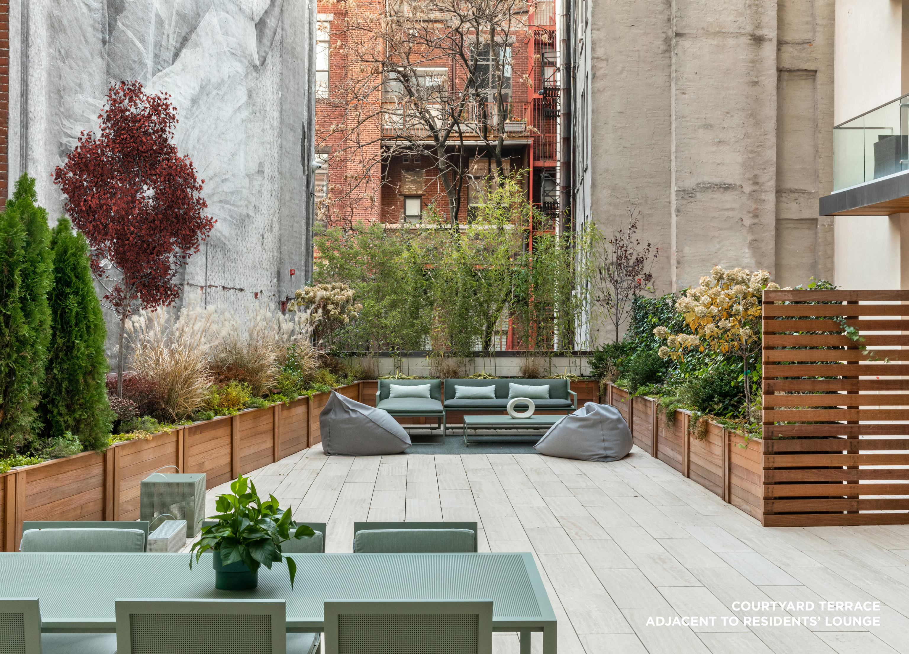
COURTYARD TERRACE ADJACENT TO RESIDENTS' LOUNGE