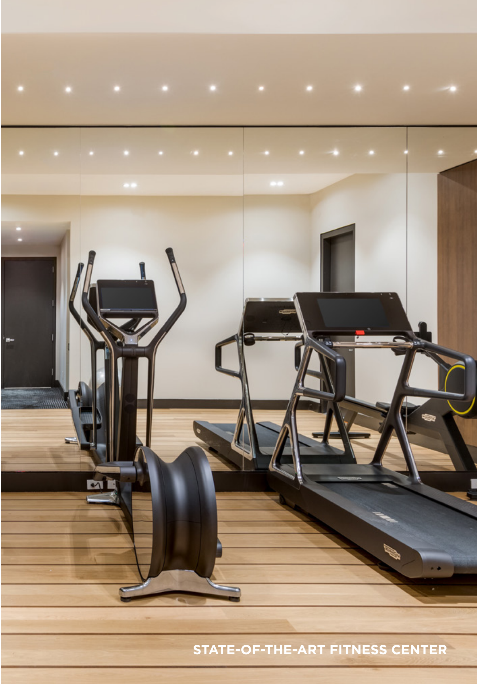
STATE-OF-THE-ART FITNESS CENTER