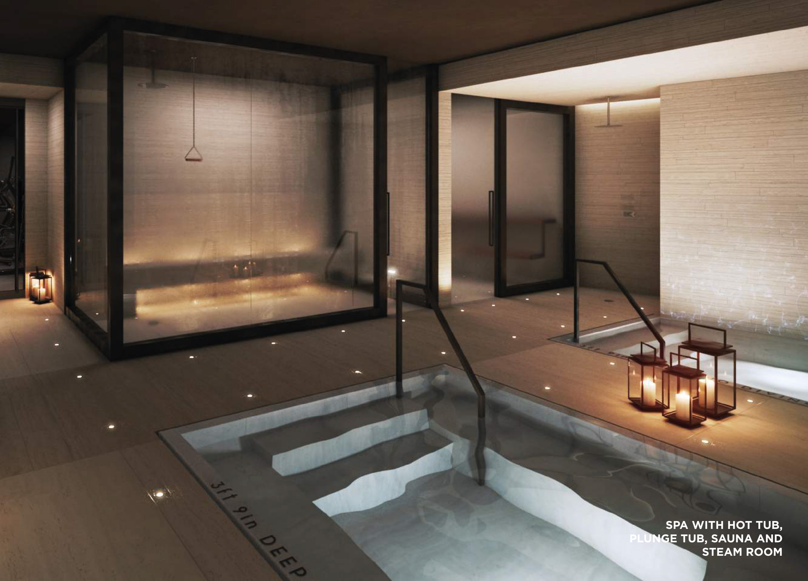
SPA WITH HOT TUB, PLUNGE TUB, SAUNA AND STEAM ROOM